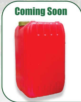
20 Litre BL