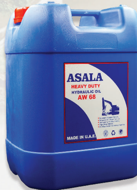
25 Litre UK