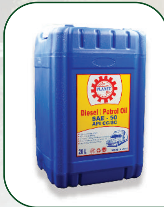
20 Litre New Juwal (EPI)