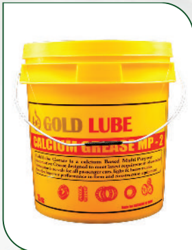
15 LITRE LONG PRINT