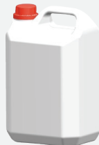
5 LTR SMITH