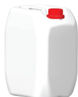
20 LTR PUMPA