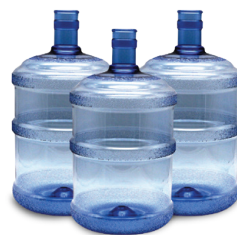
BOTTLE WITHOUT HANDLE