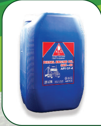
25 Litre Pamba