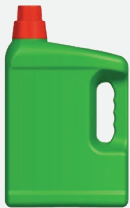
3 LTR OMAN DESIGN (OMAN DESIGN)