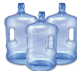
BOTTLE WITH HANDLE