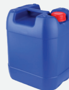
20LTR UK Design