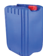
20 LTR EPI Turbo