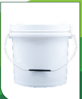
1 USG PLAIN