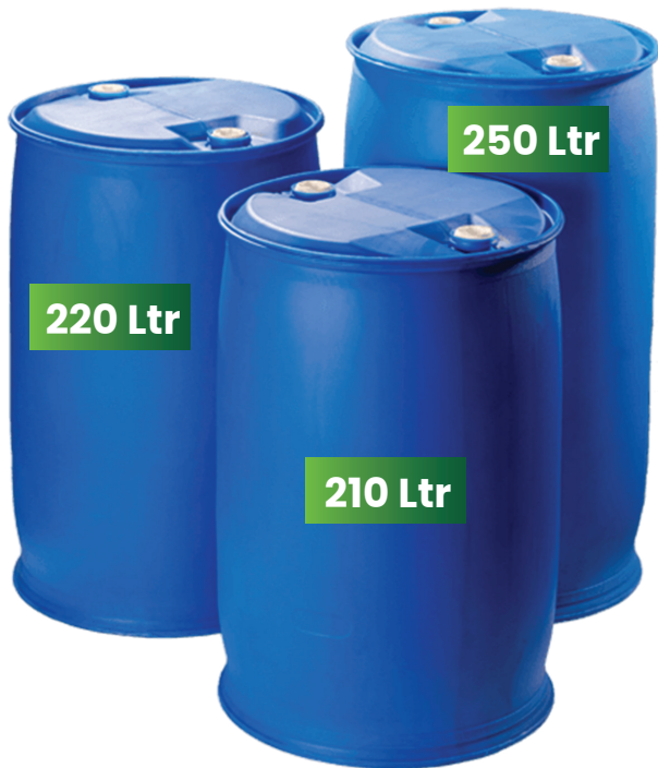
Closed Narrow Mouth