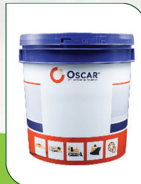
15 LITRE SHORT IML