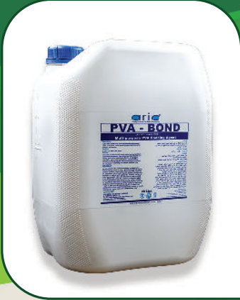
20 Litre Pamba