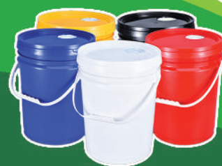
20 LITRE WITH SPOUT CAPS