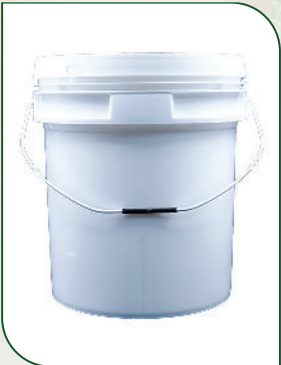
18 LITRE PLAIN