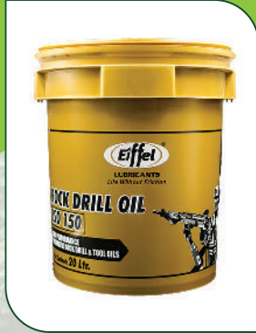
20 LITRE PRINT