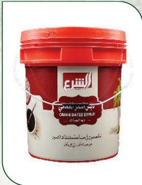
18 LITRE IML