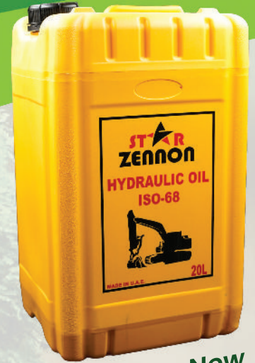
20 Litre New Juwal (EPI)