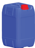
20 LTR JEWEL

All industries such as Lube, Edible Oil, Adhesives, Chemicals, Detergents, acids, alkalies, etc. Space-saving design that enables maximum utilization of space during transit.