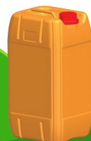
25 LTR JEWEL