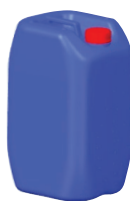
25 LTR PUMPA