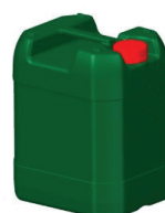
20 LTR UK Design