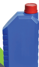
1LTR EPI TURBO