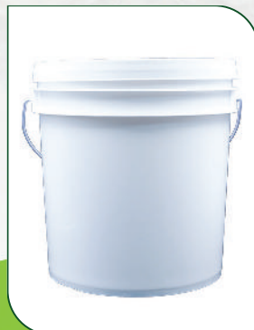
15 LITRE SHORT PLAIN