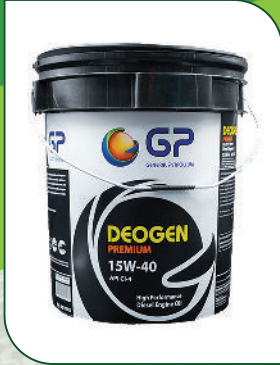
20 LITRE IML