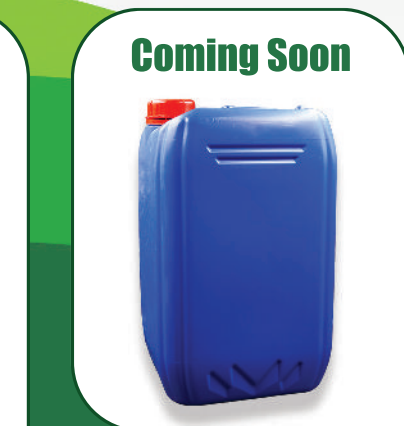
19 Litre Deluxe