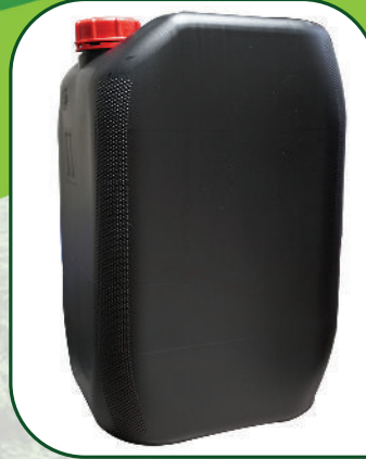
30 Litre Pamba