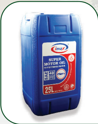
25 Litre Juwal