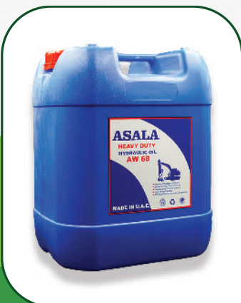
20 Litre UK