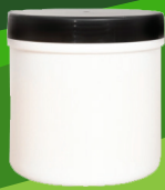
500ML COSMETIC JAR

Our packaging solutions are designed to keep you safe, preserve the integrity of your chemicals, protect the environment, and provide convenient handling and storage.