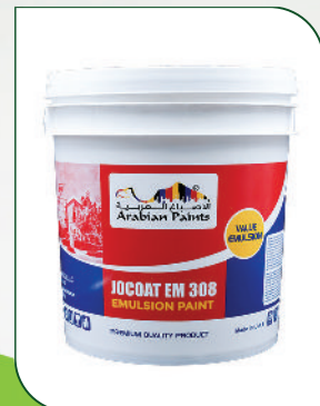
15 LITRE SHORT PRINT