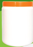
1000ML COSMETIC JAR