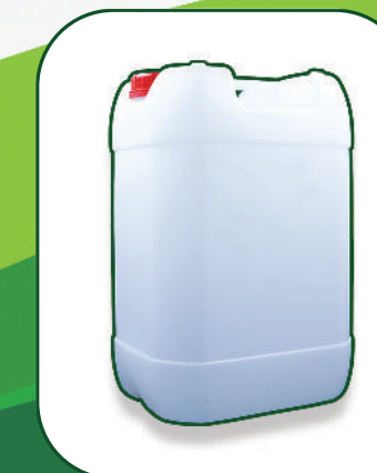
25 Litre UK