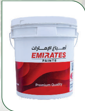
18 LITRE PRINT