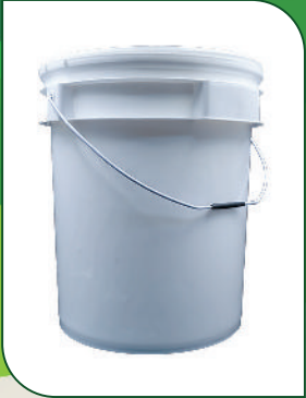
20 LITRE PLAIN