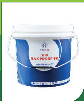
1 USG IML