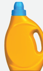
2 LTR FABRIC SOFTNER-UK