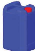
25 LTR UK Design