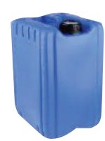
25 LTR EPI Turbo