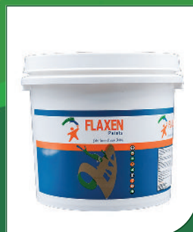
1 USG PRINT