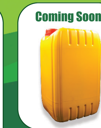
20 Litre BL